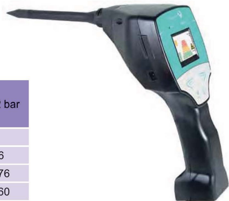
LD 400 with focus tube and focus tip for precise locating